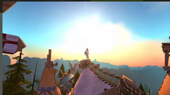
Trissian Welcomes the Light? or An'she