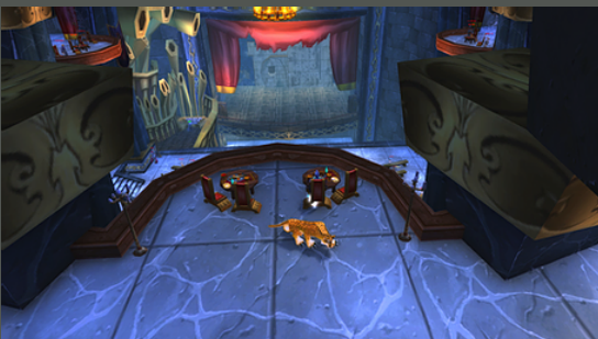
Trellin Waitin' on the Show