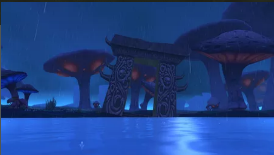
Ayashe finds a Portal in the Zan