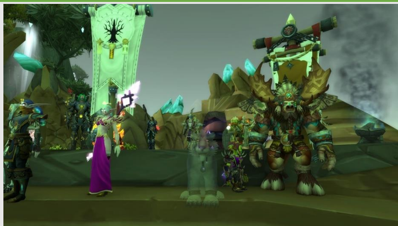
Who's Who of Kick Fish Representatives

Still room for more team registrations. Reach out to league representatives today, or just come prepared to participate this Saturday at 8:00 PM server time in Shattrath.