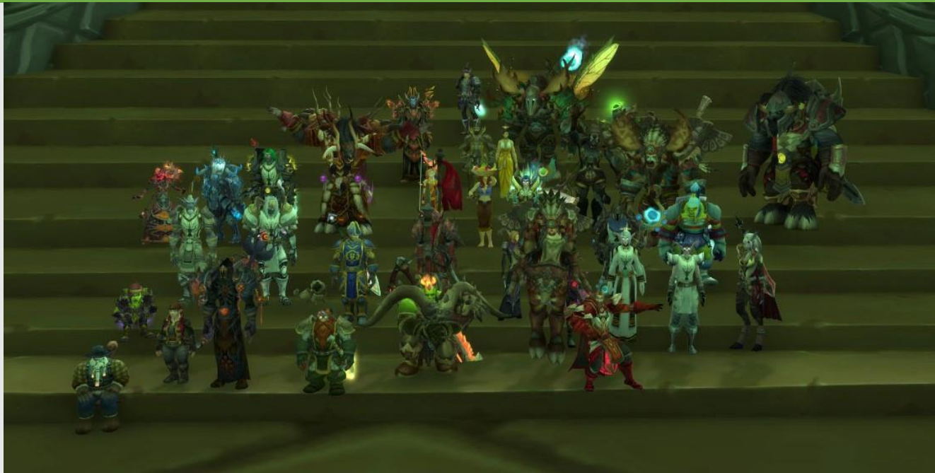
Contestants for larger categories broken into smaller groups: